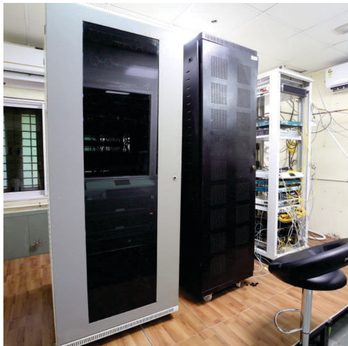
Data Centre at IT Cell, JAU

operations. Operating round the clock, the data centre boasts three different power sources, including solar panels, to ensure cost-effectiveness, uninterrupted service. The data centre serves as the backbone of JAU's IT operations, enabling efficient data storage, processing, dissemination, empowering students, faculty and staff to embrace a technologically advanced environment.