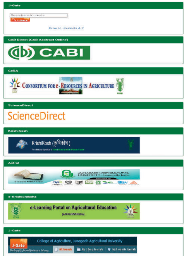
E-Resources facilities for UG/PG students

The entire university network grants users the ability to browse and search national and international journals through online access to the Consortium for e-Resources in Agriculture (CERA). Additionally, users can benefit from the J-Gate database and Krishi Prabha, an online service providing access to doctoral theses offered by All India Agricultural Universities. These resources enhance the research and learning experiences of students and staff, facilitating comprehensive access to scholarly information in the agricultural field.